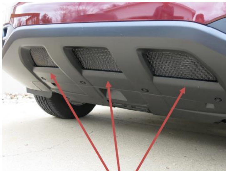
Tie Holder Positioning

Place a cable tie holder on the inside of the bumper in the areas marked below. Run a tie through the holder and the mesh. Secure together tightly, and trim. Reinstall push rivets.