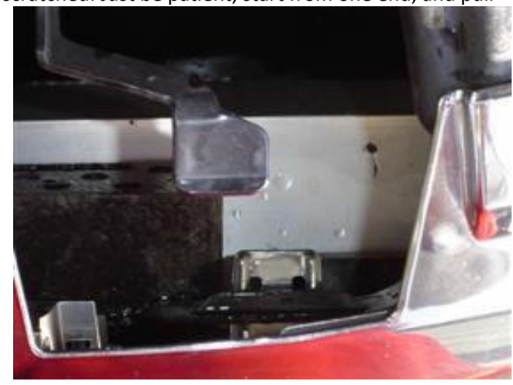
Locate attaching points

This step will require patience and constant pulling. Be careful not to yank it out to hard, or your paint can get scratched. Just be patient, start from one end, and pull