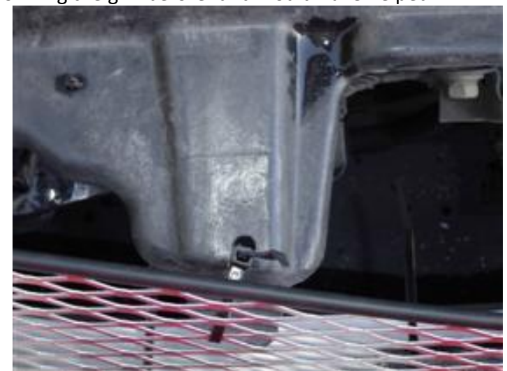
Lower hood slowly to make sure grill is attached properly. If grill bends awkwardly, re-forming the curve is necessary