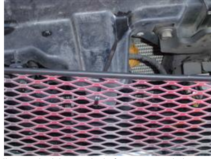
Grill is attached, but too high, form it as needed.

Before attaching the top, trim the bottom cable ties to desired length. Notice how the cable tie is attached to a point in the grill where the diamonds are complete (not cut) and not attached to the trim. Attach the top part of the grill using the 2 holes that go all the way through.