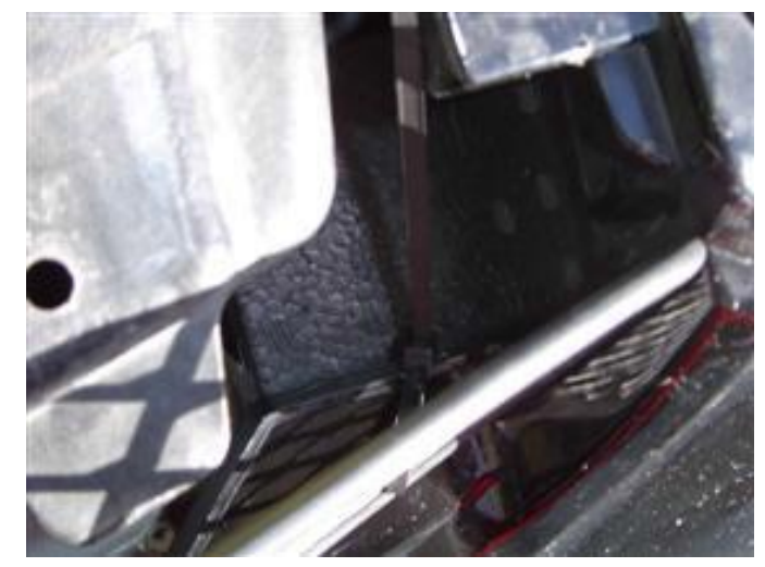
Notice how there is extra grill on top, this is where forming the grill beforehand would have helped.

Attach the cable ties on a sturdy point of the grill. This means do not tie it to the trim (see next picture). Begin by attaching the bottom of the grill. Attach from the middle, working outward.