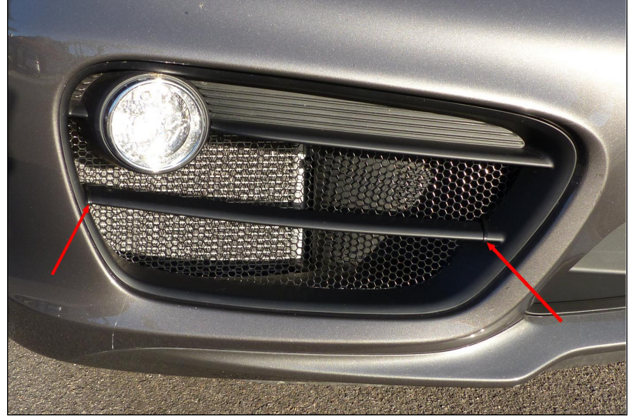
Final zip tie locations towards the very outer edge of the cross-member